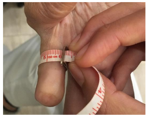
Assessment, Casting, and Measurement of the stump and sounds side

2 nd appointment: the test socket fitting.